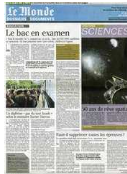
Le Monde Dossiers & Documents Mensuel