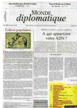
Le Monde Diplomatique Mensuel